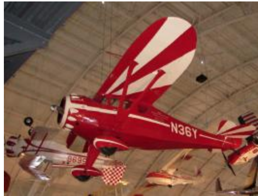
Soon the Virginia Regional Transit Association will provide an accessible and convenient way to connect existing transportation services in Loudoun County with the brand new Smithsonian Udvar-Hazy Air and Space Museum in Dulles, Virginia.

Soon after July 1st, VRTA will begin providing a new transit service that will connect existing VRTA services in Loudoun County with the newly built Smithsonian Udvar-Hazy Air and Space Museum near Dulles Airport in Virginia. The project is made possible through a joint effort between VRTA, Fairfax County, Loudoun County, the Virginia Department of Rail and Public Transportation, and the Federal Transit Administration. The project is also made possible in part through the use of