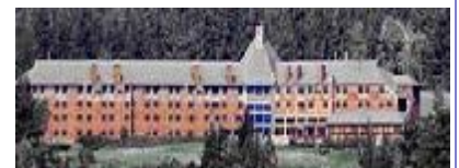
The Skamania Lodge (above) of Stevenson, Washington is located 45 miles from Portland, Oregon in the beautiful Columbia River Gorge.