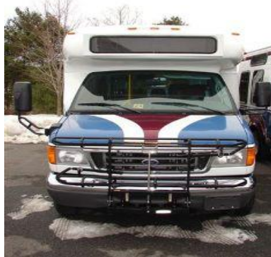
Two New Buses already on Leesburg Fixed Routes