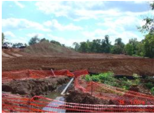
To the left: Updated picture of what the Culpeper facility currently looks like. Within the next month grading should be completed and steel should